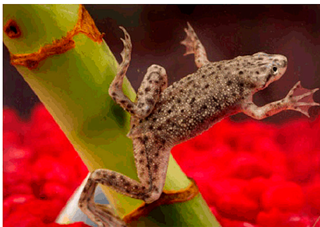
FIGURE 1 African dwarf frog, an exclusively aquatic frog measuring up to 63.5 mm long.

State diagnostic laboratories forward Salmonella strains from clinical isolates to state public health laboratories for serotyping and PFGE. PFGE patterns are electronically submitted to PulseNet, the national molecular subtyping network for foodborne disease surveillance. 7 Multiple-locus variable-number tandem repeat analysis (MLVA) may be used to further distinguish Salmonella Typhimurium isolates. A case was defined as a person with a Salmonella Typhimurium infection whose clinical isolate was indistinguishable from the outbreak PFGE pattern, and whose MLVA pattern matched the outbreak pattern or MLVA unknown, and with an illness-onset date (or isolation date if onset unknown) from January 1, 2008, to December 31, 2011.