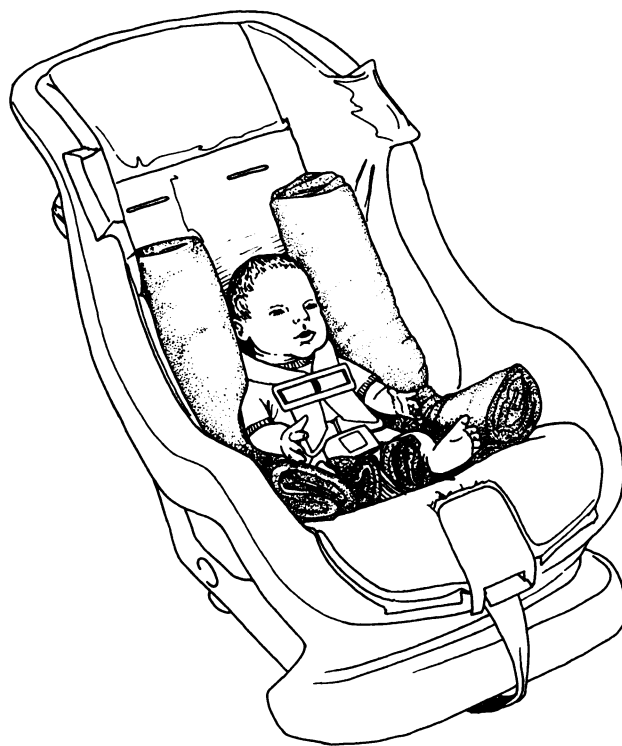
Fig 2. Car safety seat with retainer clip positioned on the infant's chest.