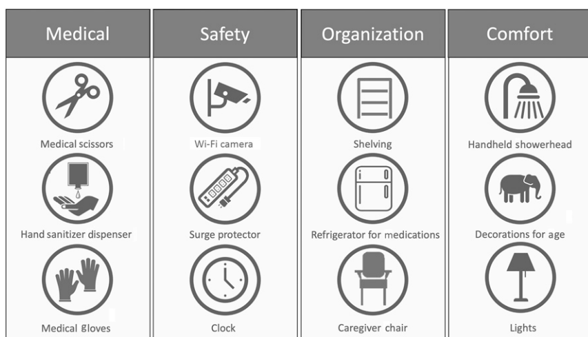
FIGURE 2 Subset of product recommendations.