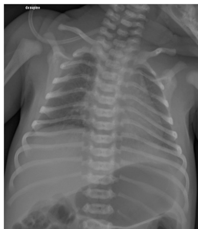
FIGURE 1 Chest radiograph of the newborn obtained on day of life 3 showing mild bilateral ground-glass opacities.

In our patient, nasopharyngeal swab remained positive for more than 2 weeks, unlike previous reports showing rapid virological clearance. 6 Together with previous reports of frequent asymptomatic infections, our finding suggests that newborns could be a source of horizontal