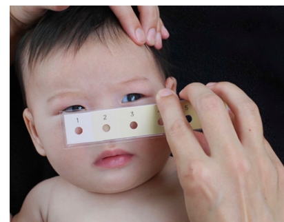
FIGURE 1 Use of the Bili-ruler on the nose of an infant at BWH in Boston.

To create the color strips, we obtained images of blanched skin of infants from Bangladesh with known serum bilirubin levels using an X-rite ColorChecker Passport (X-rite, MI) to (1) create a digital camera calibration profile and (2) standardize the color output for processing. Standardized color palettes, such as the ColorChecker Passport, are used in digital photography to neutralize the effect of the illumination on the output. We compiled a library of digital photographs of infants with varying levels of hyperbilirubinemia, ranging from none to severe, and also incorporated the highest score of the