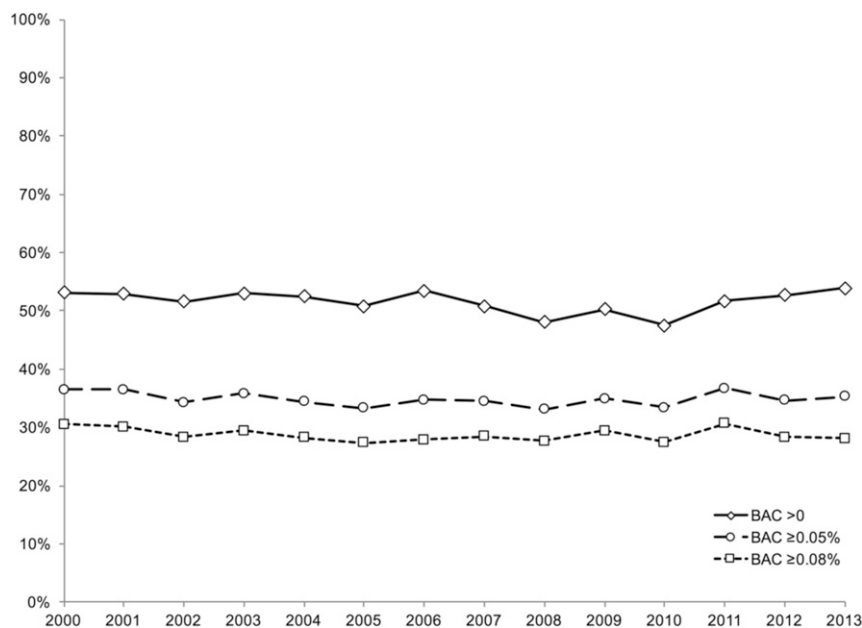
FIGURE 1 Proportion of all MVC fatalities among people \leq 20 years old that are alcohol related according to different BAC cutoffs.

Fig 3 displays the proportion of MVC fatalities that were alcohol related and the associated APS scores across states for the 2 most recent years of data available (2012–2013). Table 2 shows unadjusted and adjusted odds ratios (aORs) of alcohol-related