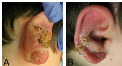
FIGURE 1 A and B, Red, indurated right earlobe with significant superficial yellow crusting and peripheral desquamation at the time of biopsy.

Repeat bacterial culture of the crusted area was performed and returned negative. Given the persistent crusting, he was treated for a likely Staphylococcus aureus infection with topical mupirocin and separate courses of clindamycin and doxycycline with minimal improvement. After 2 subsequent months of therapy with topical mupirocin and triamcinolone 0.025% ointment without improvement, a biopsy of the lesion was performed. Hematoxylin and eosin stain revealed central granulomatous inflammation with a multinucleated giant cell containing a phagocytosed yeast and a mixed chronic inflammatory infiltrate in the surrounding