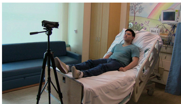
FIGURE 2 Picture of the camera setup used for video recording at the hospital bed during study visits 1 and 2.

We present an initial investigation of CVML-assisted measurement of facial expressions as a measure of children's pain in the postoperative setting. Although promising, the approach still warrants additional investigation with other forms of clinical pain and across the broad age range of children. CV analysis of facial expression requires an approximately frontal camera (Fig 2). The specifications of the CERT system tested here were \pm 15^\circ of frontal in yaw, pitch, and roll. The newer commercial version of the software (Emotient Analytics, San Diego, CA)