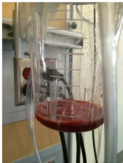
FIGURE 1 The patient's hemoptysis in a suction canister.

acetyl fentanyl that he had purchased surreptitiously on the Internet. On waking after receiving naloxone, he complained of dyspnea and was noted to be coughing up frank blood in the ED (Fig 1). Physical examination in the ED was notable for an alert patient oriented to person, place, and time with tachypnea, blood in his nares, an increased work of breathing, and coarse rales in all lung fields on auscultation. His initial chest radiograph was notable for bilateral “batwing”-shaped perihilar predominant airspace opacities with diffuse increased interstitial markings (Fig 2). Laboratory values were as follows: white blood cell count 17.6 k/cmm, platelets 217 k/cmm, hemoglobin 15.5 g/dL, sodium 136 mEq/L, potassium 3.6 mEq/L, chloride 108 mEq/L, bicarbonate 25 mEq/L, creatinine 1.06 mg/dL, glucose 142 mg/dL, aspartate aminotransferase 37 IU/L, alanine aminotransferase 22 IU/L, total creatine kinase 318 IU/L, troponin 0.103 µg/L, pro-brain natriuretic peptide 41 pg/mL, activated partial thromboplastin time 27.3 seconds, prothrombin time 15.3 seconds, fibrinogen 309 mg/dL, and lactate 0.8 mmol/L. Urine drug screening was negative for cocaine,