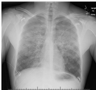
FIGURE 2 PA chest film demonstrating bilateral “batwing”-shaped perihilar opacities with diffuse interstitial markings.

methamphetamine, and other sympathomimetics. Immunoassays for opiates and fentanyl were both positive; however, high-performance liquid chromatography and mass spectrometry revealed no evidence of fentanyl. The substance snorted by the patient was identified by the Bureau of Criminal Apprehension by using high-performance gas chromatography and mass spectrometry as butyrfentanyl.