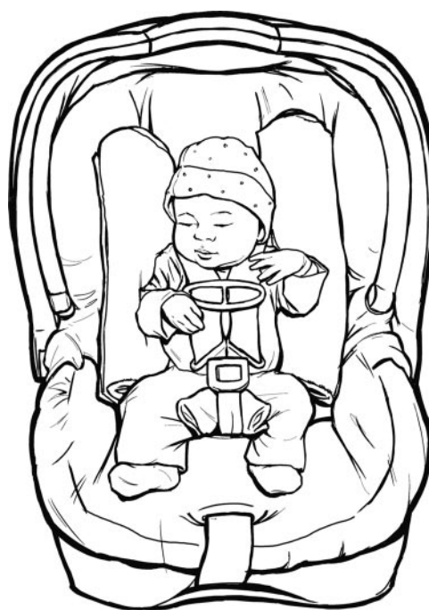
FIGURE 1 Car safety seat with a small cloth between crotch strap and infant, retainer clip positioned at the midpoint of the infant's chest, and blanket rolls on both sides of the infant.

the potential for the infant to slip forward feet-first under the harness (ie, "submarining"). Some car safety seats have crotch-to-seat back distances as short as 5.5 in, which may accommodate some preterm or low birth weight infants well. A small rolled diaper or blanket between the crotch strap and the infant may be added to reduce the risk of submarining (Fig 1) in smaller infants. A car safety seat with multiple harness-strap slots provides more choice and may be more suitable for small but rapidly growing infants. Ideally, car safety seats with harness straps that can be positioned at or below the shoulders should be selected. 21