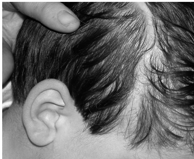
FIGURE 1 Indurated, yellowish, linear plaque on parietal scalp.

At the time of presentation to our clinic, the patient's parents reported rapid expansion of the cutaneous lesion. On examination, there was a 12-cm indurated, linear plaque on the right parietal scalp that extended from just behind the ear to the frontal hairline (Fig 1). This lesion was mostly yellow in color, but the advancing edge was violaceous. On the right upper arm the patient also had four 2- to 3-cm, dull pink-brown, atrophic patches. An atrophic, smooth, elliptical patch orientated longitudinally was also noted on the right side of the patient's tongue (Fig 2). A detailed neurologic examination revealed decreased retraction and depression of the right angle of the mouth, which affected his smile. Elevation of the right angle of the mouth was slightly diminished compared with the left with nasolabial fold sparing. Taste was decreased on the right side of his tongue compared with his left. All other cranial nerves were intact. Follow-up MRIs have been normal.