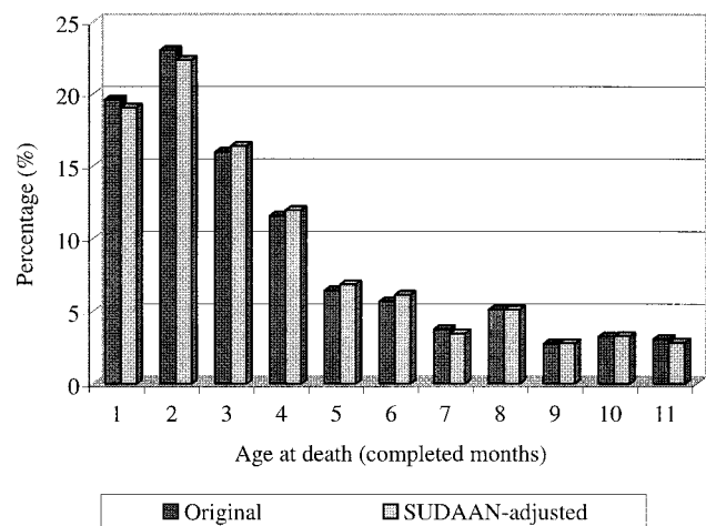
Fig 2. Age at death for postneonatal deaths.

After adjustment for sampling strategy with SUDAAN, 53% of control infants were ever breastfed, compared with 38% of cases. Logistic regression models showed an OR of 0.79 (95% CI: 0.67–0.93) for ever breastfed (Table 3). Race-specific analyses gave similar estimates for the OR, although the proportion ever breastfed was much lower in black infants. For the low birth weight infants, the OR of ever breastfed was 0.97 (95% CI: 0.64–1.47). The estimates from logistic models changed only slightly by category of cause of death (Table 3). The overall risk estimate changes little even when we include deaths as a result of an underlying congenital anomaly ( n = 212 ) or malignant tumor ( n = 10 ); the OR for overall postneonatal death was 0.74 (95% CI: 0.63–0.87). Among cases only, a proportional hazard model showed that the risk of death at any specific time was