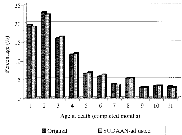
Fig 2. Age at death for postneonatal deaths.

After adjustment for sampling strategy with SUDAAN, 53% of control infants were ever breastfed, compared with 38% of cases. Logistic regression models showed an OR of 0.79 (95% CI: 0.67–0.93) for ever breastfed (Table 3). Race-specific analyses gave similar estimates for the OR, although the proportion ever breastfed was much lower in black infants. For the low birth weight infants, the OR of ever breastfed was 0.97 (95% CI: 0.64–1.47). The estimates from logistic models changed only slightly by category of cause of death (Table 3). The overall risk estimate changes little even when we include deaths as a result of an underlying congenital anomaly ( n = 212 ) or malignant tumor ( n = 10 ); the OR for overall postneonatal death was 0.74 (95% CI: 0.63–0.87). Among cases only, a proportional hazard model showed that the risk of death at any specific time was