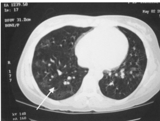
Fig 2. CT of the chest (day 51) of case 1 shows ground-glass appearance in both lung fields.

receiving ribavirin, steroid, and low-setting ventilatory support, although the recovery might have been spontaneous and unrelated to antiviral and steroid therapy. Children <12 years old were found to have a mild disease course. 6,7 However, these 2 adolescent girls had progressive deterioration, although appar-