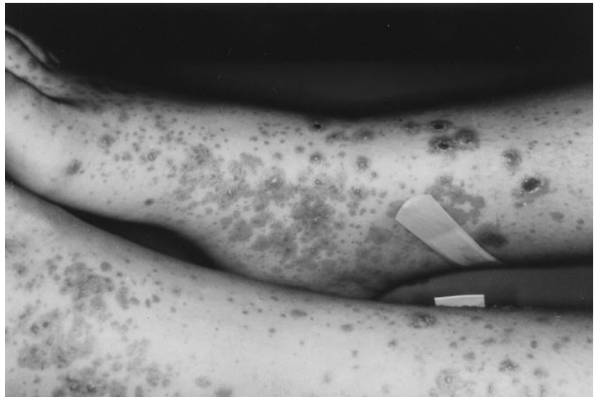
Fig 1. Multiple purpuric papules, some with darker centers and purpuric halos and others with central ulceration, on the bilateral lower extremities.

polymeric IgA, circulating immune complexes that contain IgA, and IgA rheumatoid factor demonstrable in most cases. 1