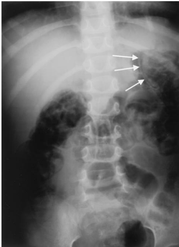
Fig 1. Abdominal radiograph of 4-year-old girl with PI diagnosed 36 months after bilateral lung transplantation. Arrows illustrate linear appearance of PI in the bowel wall.