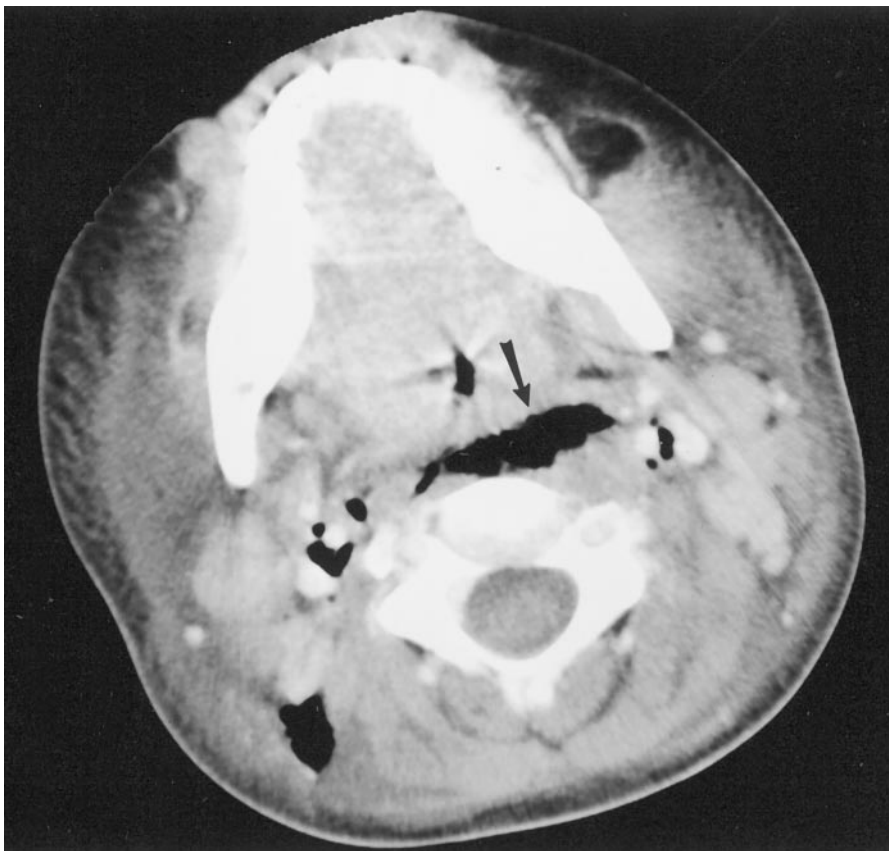
Fig 2. Axial CT scan showing extensive soft tissue swelling and subcutaneous emphysema in the retropharyngeal space (black arrow) and bilateral carotid sheaths.

tissue films of the lateral neck are often used to evaluate suspected epiglottitis, they require precious time and an attendant with the ability and equipment to provide definitive airway management should airway obstruction occur. Nasopharyngoscopy by the otolaryngologist was used effectively and safely in this case of a toxic-appearing child with suspected epiglottitis to quickly and noninvasively evaluate the airway in the trauma bay. However, a cricothyrotomy kit was available and all aggressive