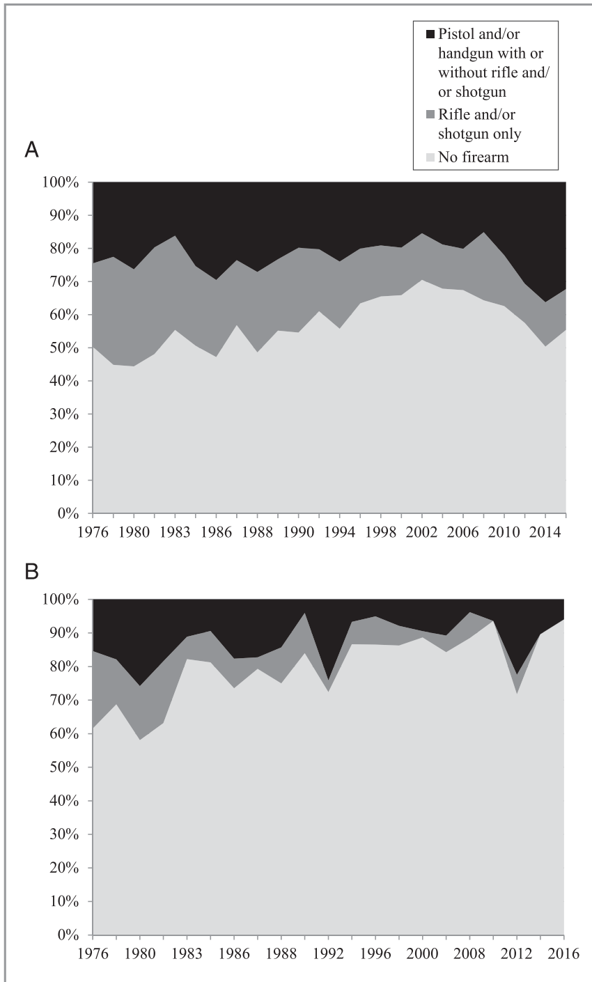
FIGURE 2 A, Firearm ownership and type of firearm: White families with young children. B, Firearm ownership and type of firearm: African American families with young children.