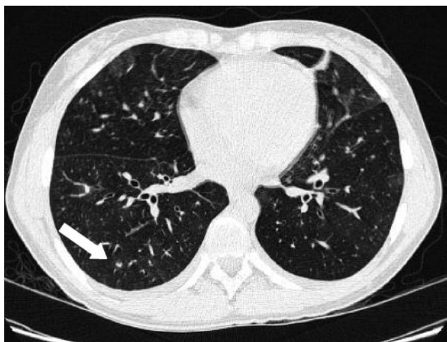
FIGURE 1 Non-contrast-enhanced axial computed tomography image of the lungs at presentation with multifocal noncavitary pulmonary nodules (the arrow indicates 1 nodule).

Additional testing revealed that the patient was puri-