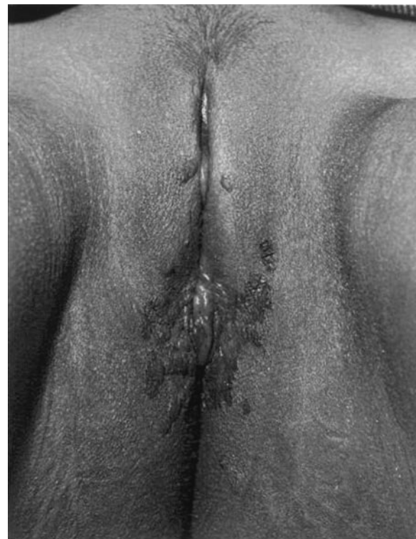
Fig 1. Multiple dark-brown papules and confluent plaques are present before initiation of treatment.

A 9-year-old black girl with HIV presented with a 4-year history of asymptomatic brown papules in the genital area. The patient's past medical history was significant for HIV with the onset of HIV encephalitis at age 4. She also had residual spastic quadriplegic