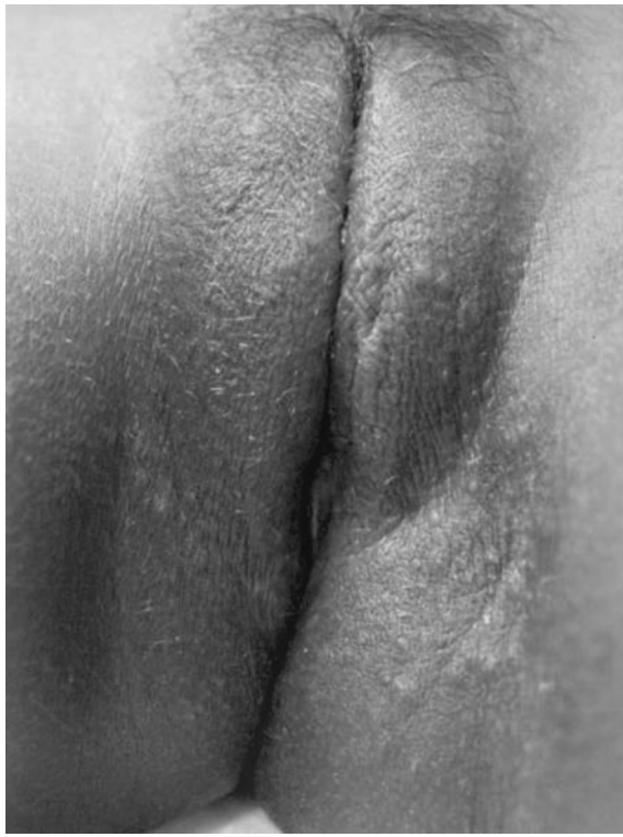
Fig 3. Complete resolution of lesions after 14 months of therapy with topical imiquimod and podophyllin.

months (Fig 3). No dysplastic or neoplastic changes have been noted. To date, our patient has had no recurrence of the lesions on external genital examination, and a repeat gynecologic examination under anesthesia has been scheduled.