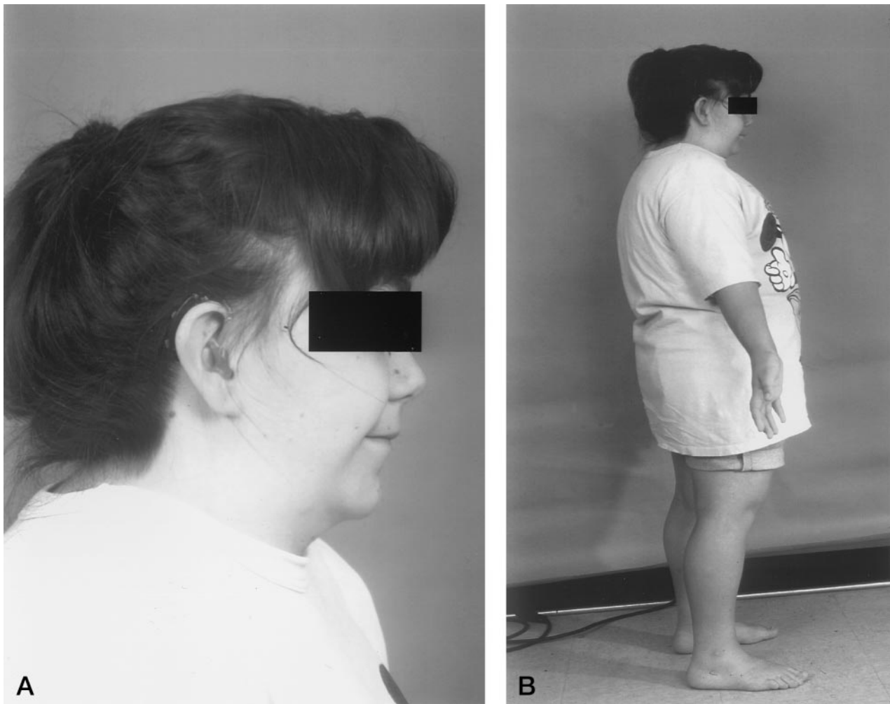
Fig 1. Lateral views of an adolescent with TS and excessive kyphosis.

and second pharyngeal arches, and in bone marrow. 14