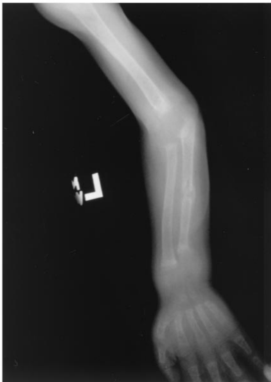
Fig 5. Radiograph of the left forearm showing a pathologic fracture of the ulna and disuse atrophy in addition to the features of rickets noted in Fig 4.

Nutritional rickets was once a major pediatric health scourge in the United States. To combat rickets, commercially prepared milk has been fortified with vitamin D since the late 1920s. This practice has been so successful that this malady is now rare. In 1999 the Food and Drug Administration authorized the use of health claims regarding the role of soy protein in reducing the risk of coronary heart disease. 30 Soy beverages have become a favored alternative to milk for many consumers. All the arguments in favor of vitamin D fortification of milk apply equally well to any beverage that replaces milk. In Canada, where fortification of all forms of milk (fluid, dried, and evaporated) with vitamin D was not universal until the late 1960s, rickets continued to be a significant problem 31 until universal fortification became standard practice. If we are to avoid relearning the lessons of the past, we should ensure that beverages that replace milk are also fortified with vitamin D and calcium to prevent a resurgence of rickets and osteomalacia.