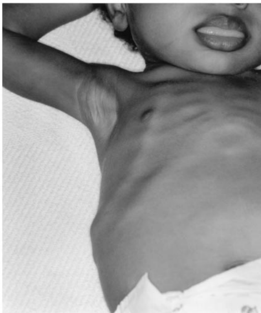
Fig 3. The rachitic rosary (a row of beading at the junction of the ribs with their cartilages) is clearly seen.

Pertinent negative laboratory findings included a normal complete blood count and differential, normal erythrocyte sedimenta-