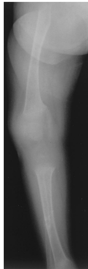
Fig 4. Anteroposterior radiograph of the right leg showing osteopenia and osteomalacia. Widening of the epiphyseal plate, cupping, and fraying of the metaphyses are also seen.

This infant was breastfed until 10 months of age without receiving supplemental vitamin D. This likely contributed to the development of rickets. Breast milk does not provide enough vitamin D 22,23